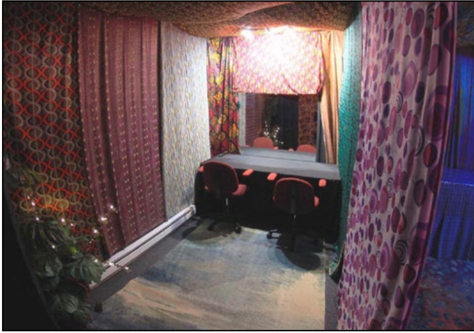
Main Suite Vanity