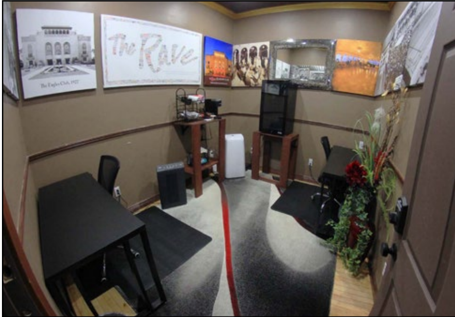
Visiting Production Office 1