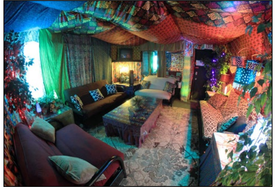
Main Suite Room 1