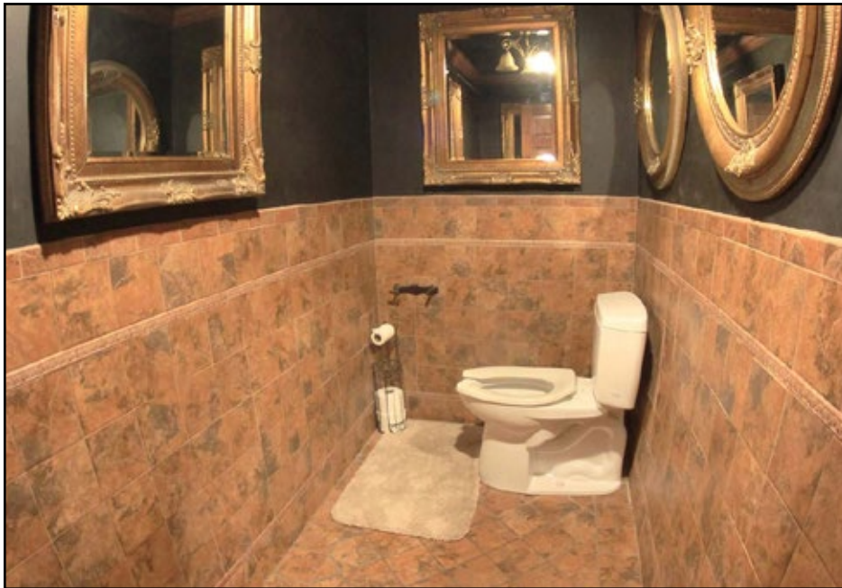
Main Suite Toilet