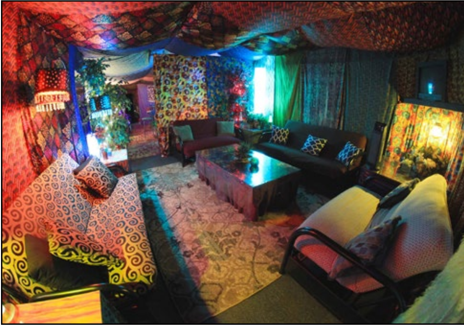
Main Suite Room 1