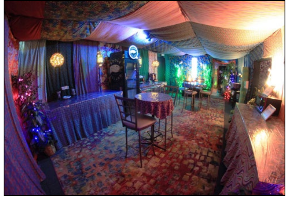
Main Suite Room 2