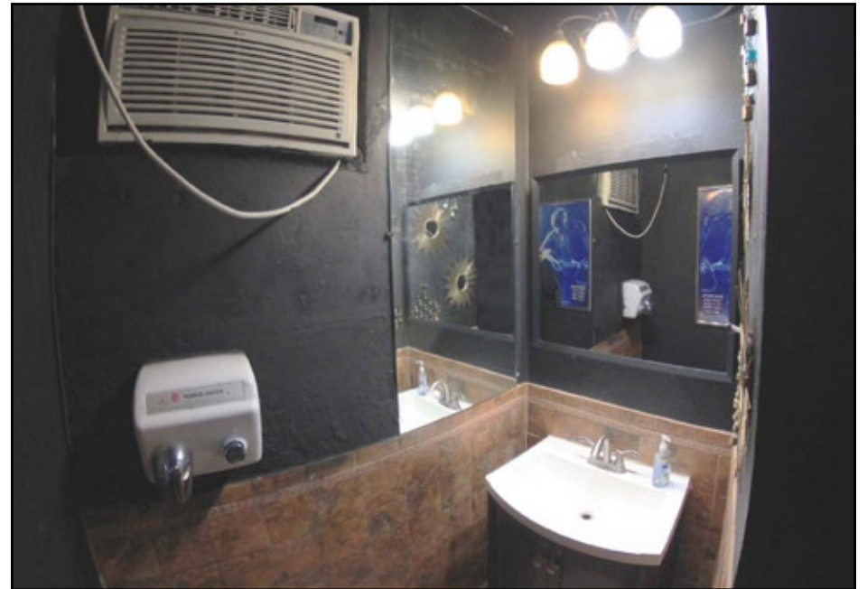
Main Suite Sink