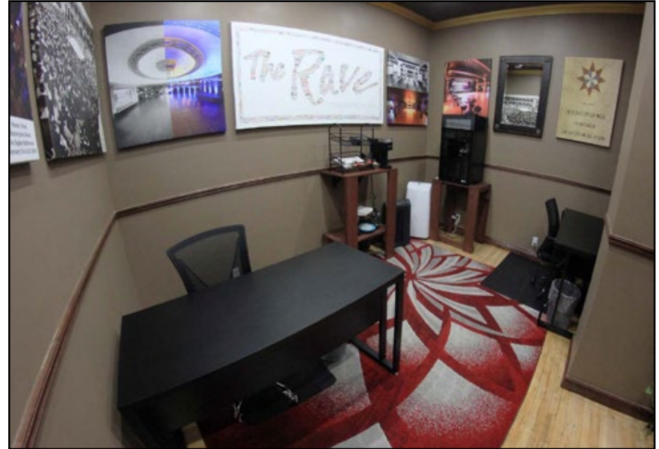
Visiting Production Office 2