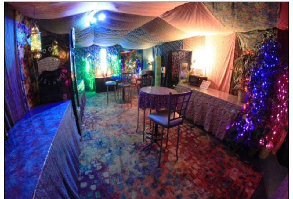
Main Suite Room 2