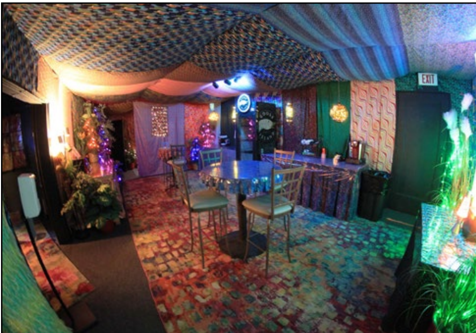
Main Suite Room 2