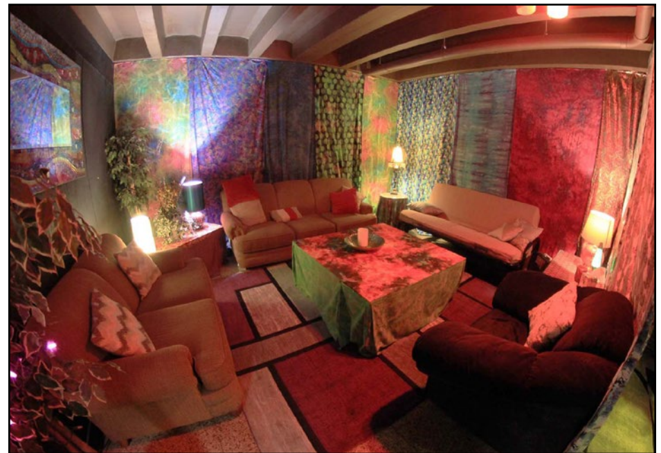
Bowlero Dressing Room