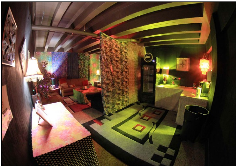
Bowlero Dressing Room