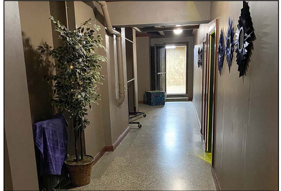
Hallway to dressing rooms and showers