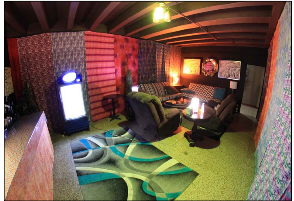
Shangri-La Dressing Room