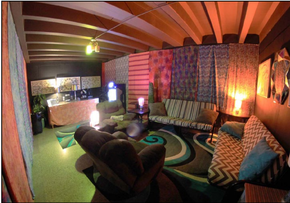
Shangri-La Dressing Room