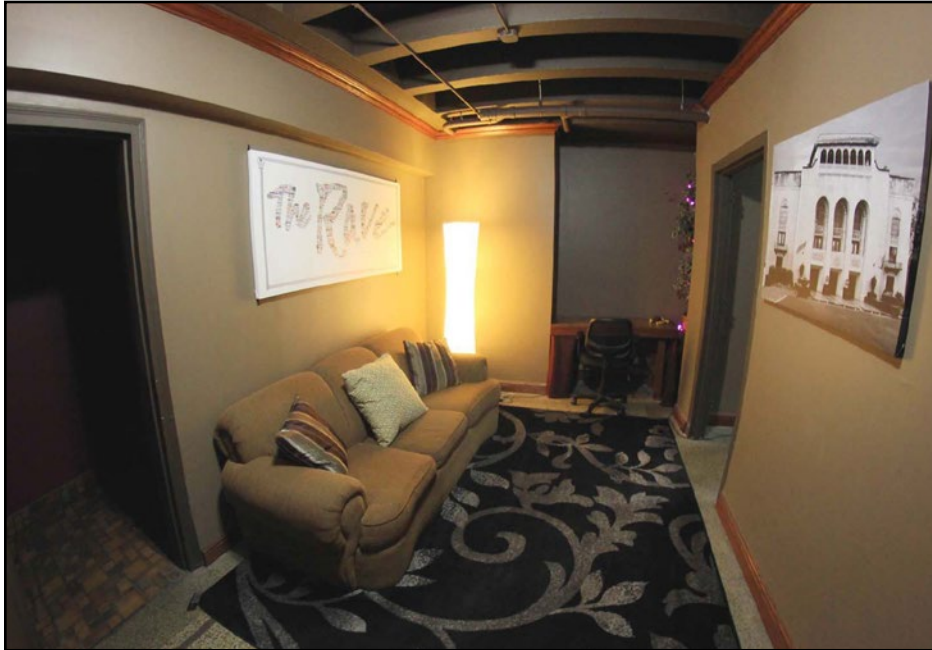
Hallway / Common area